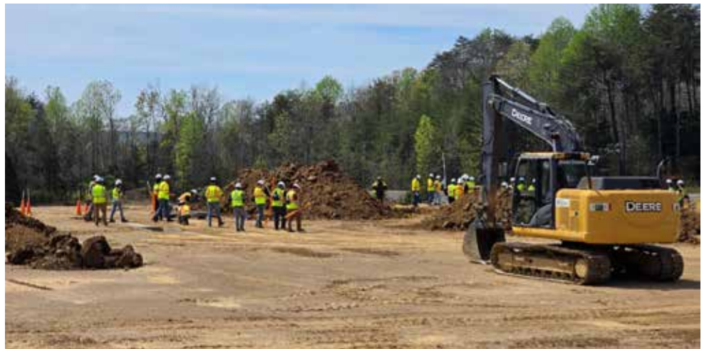
OSHA Training – Excavations held at Boston Training Site, teaching OSHA Compliance Officers