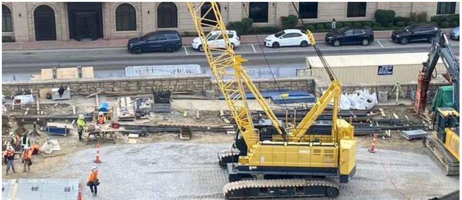
All Crane at Pikeville University