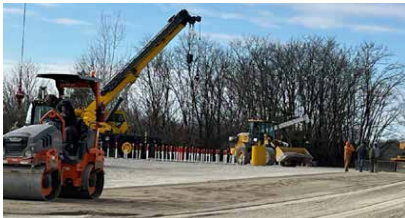
JATC: Apprentice Cody Nash training on the Komatsu dozer at Lynnville .