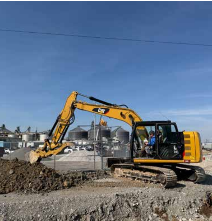
Thompson Plumbing at the Air Gas Plant in Hopkinsville, KY

The million-dollar question in District Five is when all the work is going to start at USEC? We have picked up a