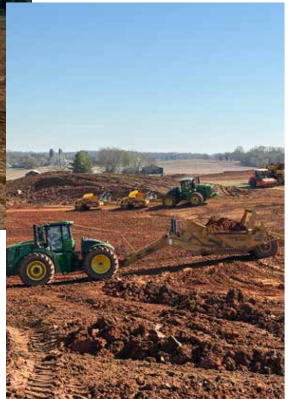
Fisher Contracting on Horus Solar Project

We will continue to work with our contractors to secure more work in the area and provide them with skilled Operators. With that said, I would like to remind everyone to please take advantage of the training sites and update your skill sheet.