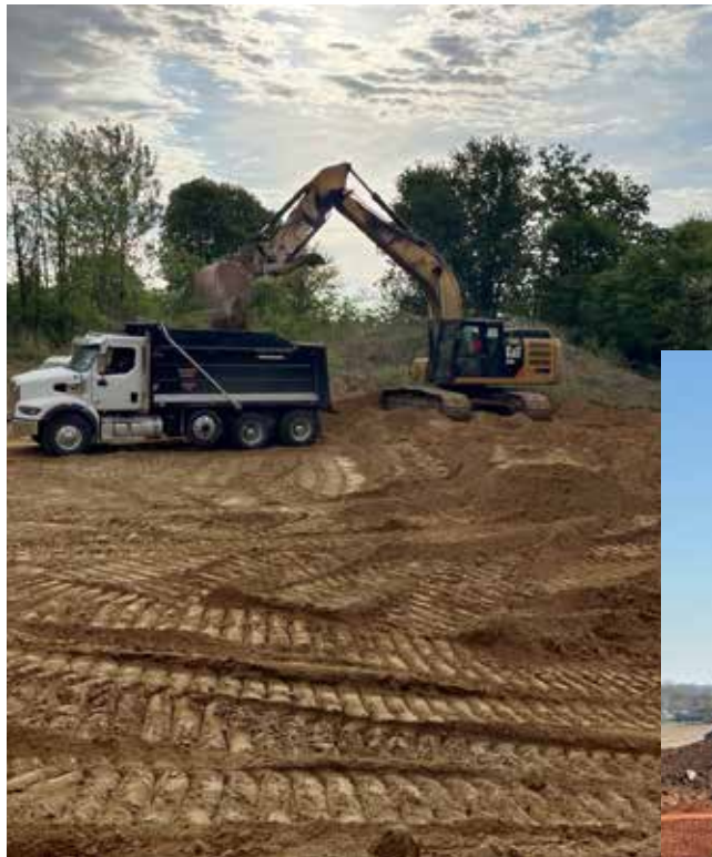
Hazex working in Owensboro, KY

In the Owensboro area Ragle, Inc., was awarded a new roundabout on Old Hartford Road and is looking at bidding another one up the road from it in July of this year. Hazex Construction has had multiple jobs in the area, with one being a nice-sized project at Mizkan in Owensboro. Deig Bros. is continuing the waterline work in Union County and continues to bid for more jobs in the area. Ryan Inc. Central has a few members working in Ohio County on a landfill project and Sierra Bravo has several members on a landfill job in Hopkins County. Both contractors use a lot of GPS dozers and excavators along with the normal articulating trucks, water trucks, rollers and road graders associated with that type of work.