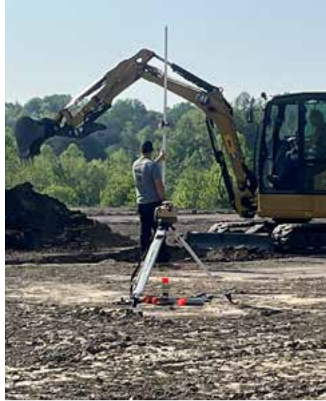
Skills Improving at Lynnville Training Site