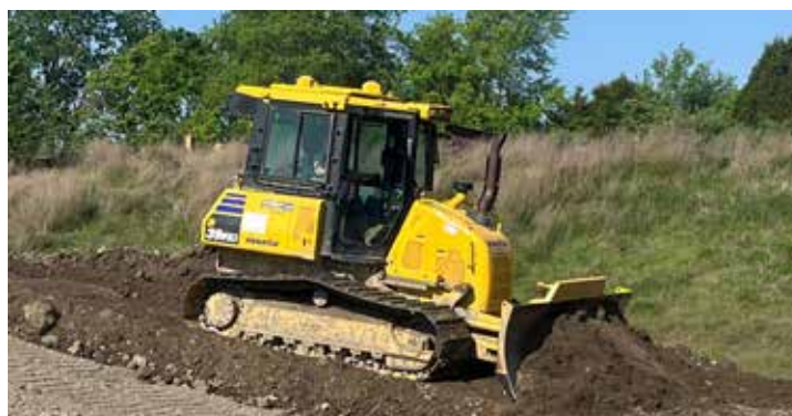
New Grove RT540 at Lynnville