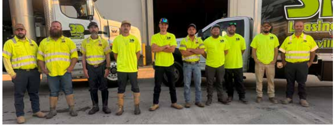
New members from 3-D Leasing