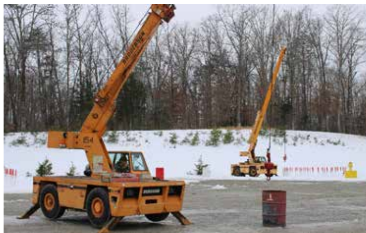
TVA Class at Boston

Keep up your certifications, add new skills, utilize your training centers. It's a statement that we tell all our new Apprentices. The More You Learn, the More You Earn.