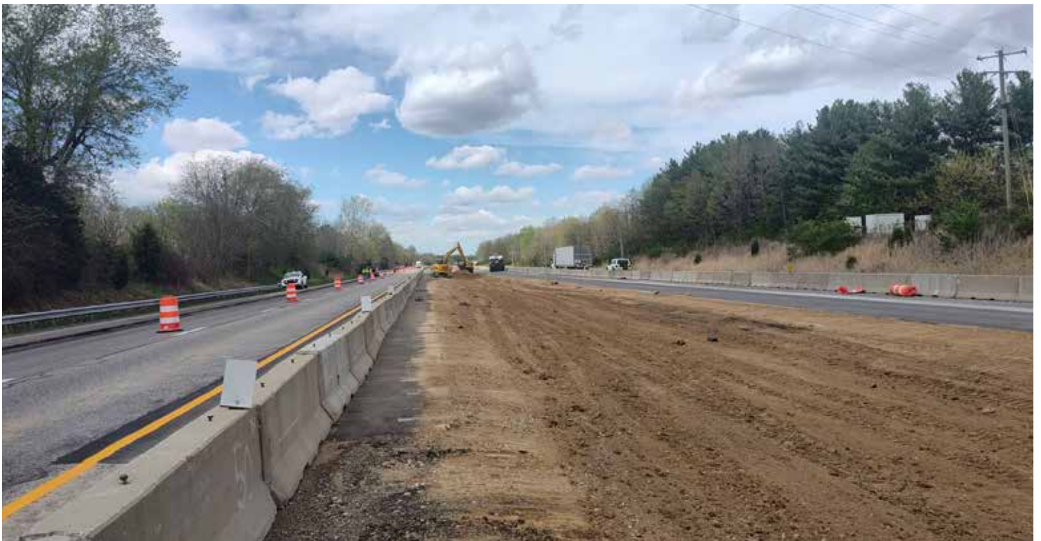
John R. Jurgensen Company working on I-74 in Greensburg, IN

The Ford facility in Shelbyville, KY, has undergone several name changes and is now referred to as the Ford Shelbyville High Tech Facility. The project is on schedule moving along well. Ford has started producing some of the test run aluminum castings. The second phase addition continues with Central Rent-A-Crane and Walbridge hanging steel. Atlas Industrial and PSC Crane and Rigging