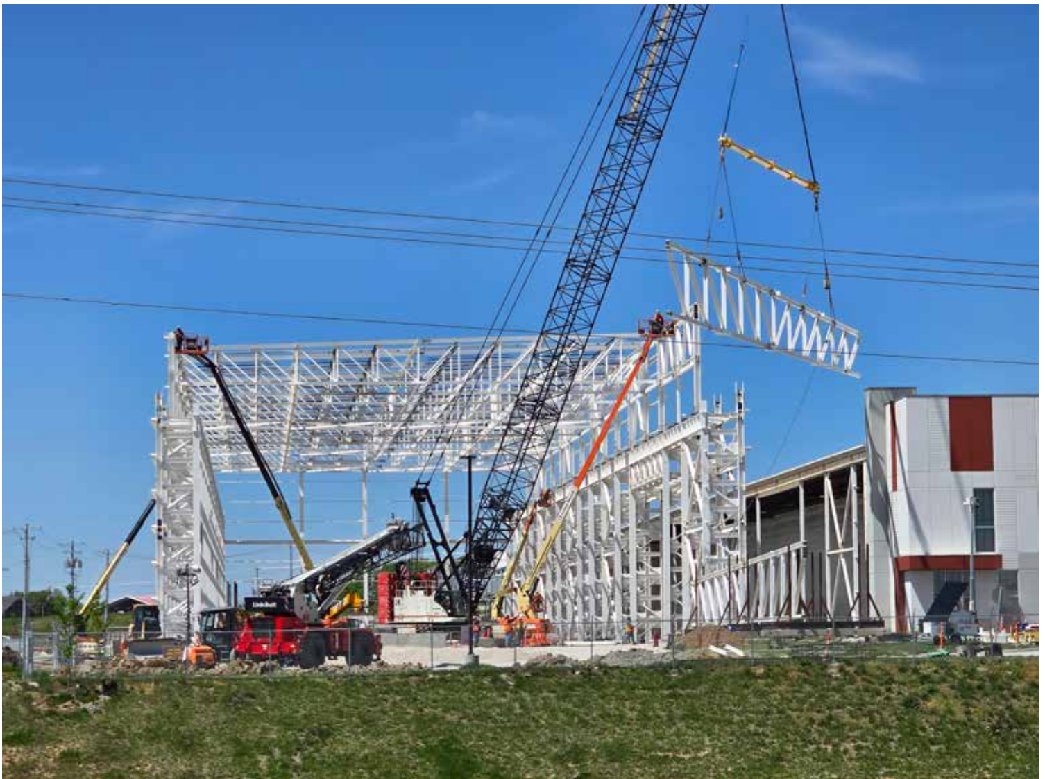
Central Rent-A-Crane & Walbridge Equipment and Industrial Ford Shelbyville High Tech Facility in Shelbyville, KY

We encourage you to attend your monthly meetings, held the first Tuesday of each month (except June and December) at 7:00 p.m.