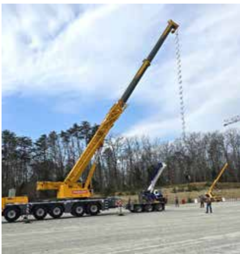
TVA Crane Certification Class held at the Boston Training Site