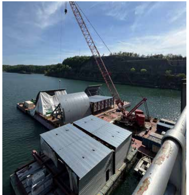
DS4 American Bridge Co. Wolf Creek Dam, Jamestown, KY

and sisters, please feel free to call me at (859) 278-8458 or visit the office anytime.