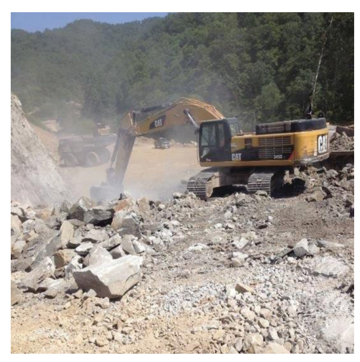
Hi-View working on the Mt. Parkway project in Morgan County, Kentucky.