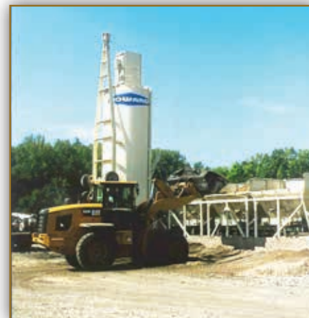
Howard Concrete Pumping at the McElroy Subdivisions project in Warrick County, IN.

Industrial Contractors Skanska has outage work going on at SABIC and has also picked up work at the Toyota Expansion Project in Gibson County. Sterling Boiler has outage work at I.P. & L. and Duke as well as work at A.B. Brown. Bowen is at the I.P. & L. site on the new Water Treatment Plant. This project is almost complete. Pullman Power has a reline job going on at I.P. & L. and has also picked up outage work at the same site. BMWC at I.P. & L. also picked up part of the outage work there. State