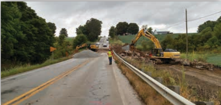
HIS Constructors replacing box culverts on US 421 south of Greensburg, Indiana.

Midwest Steel is nearing completion of the Downtown Louisville Convention Center utilizing