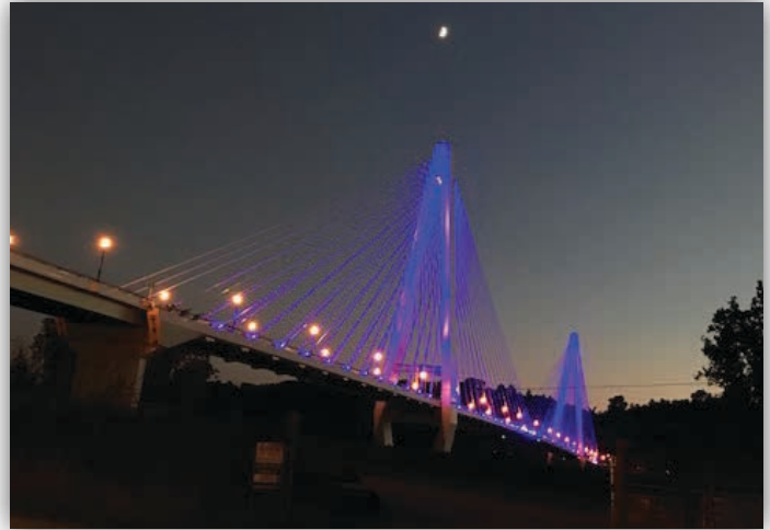
The Ironton Russell Bridge at night.

Everyone has heard about the 1.3 billion dollar aluminum plant Braidy Industries will build in Greenup County. This would be a much needed boost, and we hope to see our union contractors get their fair share of the work. Stein continues to have work at AK Steel and has picked up a few operators. It appears they are moving some of their machinery to the Middletown Ohio site. The future of AK Steel remains unknown but it doesn't look good.