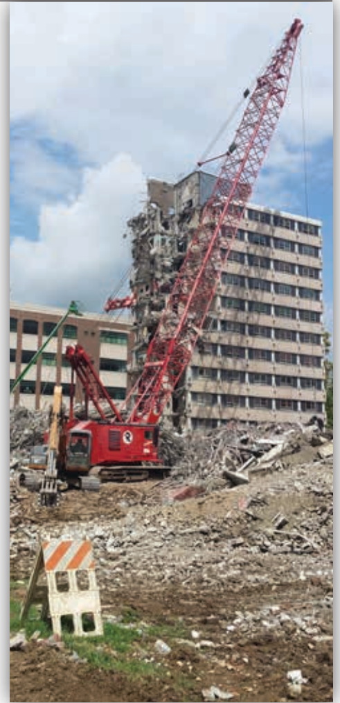
Renascent on the Eastern Kentucky University project in Richmond, Kentucky.

If we can assist you in any way, please call the Lexington office at 859-278-8458. ♦