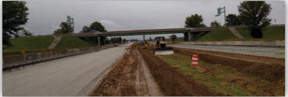
Milestone on I-74 near Batesville, Indiana.

two 2250 Manitowoc Crawlers, multiple Rough Terrain Cranes, and various forklifts erecting over 4000 tons of steel. Midwest also continues work at the Ford Louisville Assembly Plant installing new shelf storage systems.