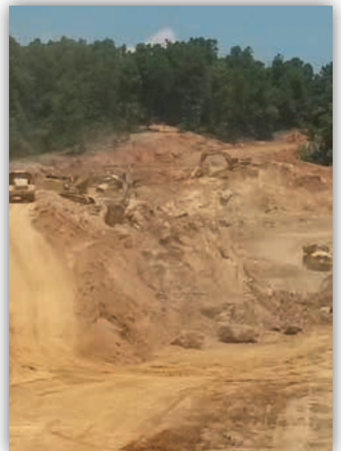
Jim Smith Contracting removing overburden at Warren Paving Quarry in Pinkneyville, KY.