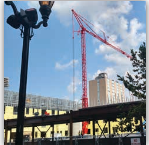
Prescient at 4th and Chestnut apartments in Louisville, Kentucky.

they are milling and laying new pavement and replacing the existing sidewalks. Dave O'Mara's work continues at Cummins Plant in Walesboro, on a new truck parking lot and a retention pond. In Butlersville, Dave O'Mara has the demolition of the existing bridge over Otter Creek on County Road 550 and replacing it with a new structure. Recently, Dave O'Mara set a girder bridge across Paw Creek for a new walk path in Columbus. In Jeffersonville the utilities have been set back on 10th St. for the addition of a left hand turning lane to what is now only four lanes of traffic. This project starts just past the Quartermaster Office Complex and extends to Allison Lane. O'Mara was recently awarded the paving work for multiple county roads in Scott County.