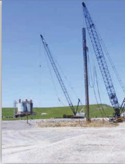
Goettle Equipment at the Shawnee Steam Plant.

In closing we want to encourage all members to attend the monthly meetings held the first Tuesday of every month (except June and December) at the AFL-CIO building located at 1202 South 4th Street, Paducah, KY at 7:30 pm. If we can be of any assistance, please call our office at 270-443-7766. ♦