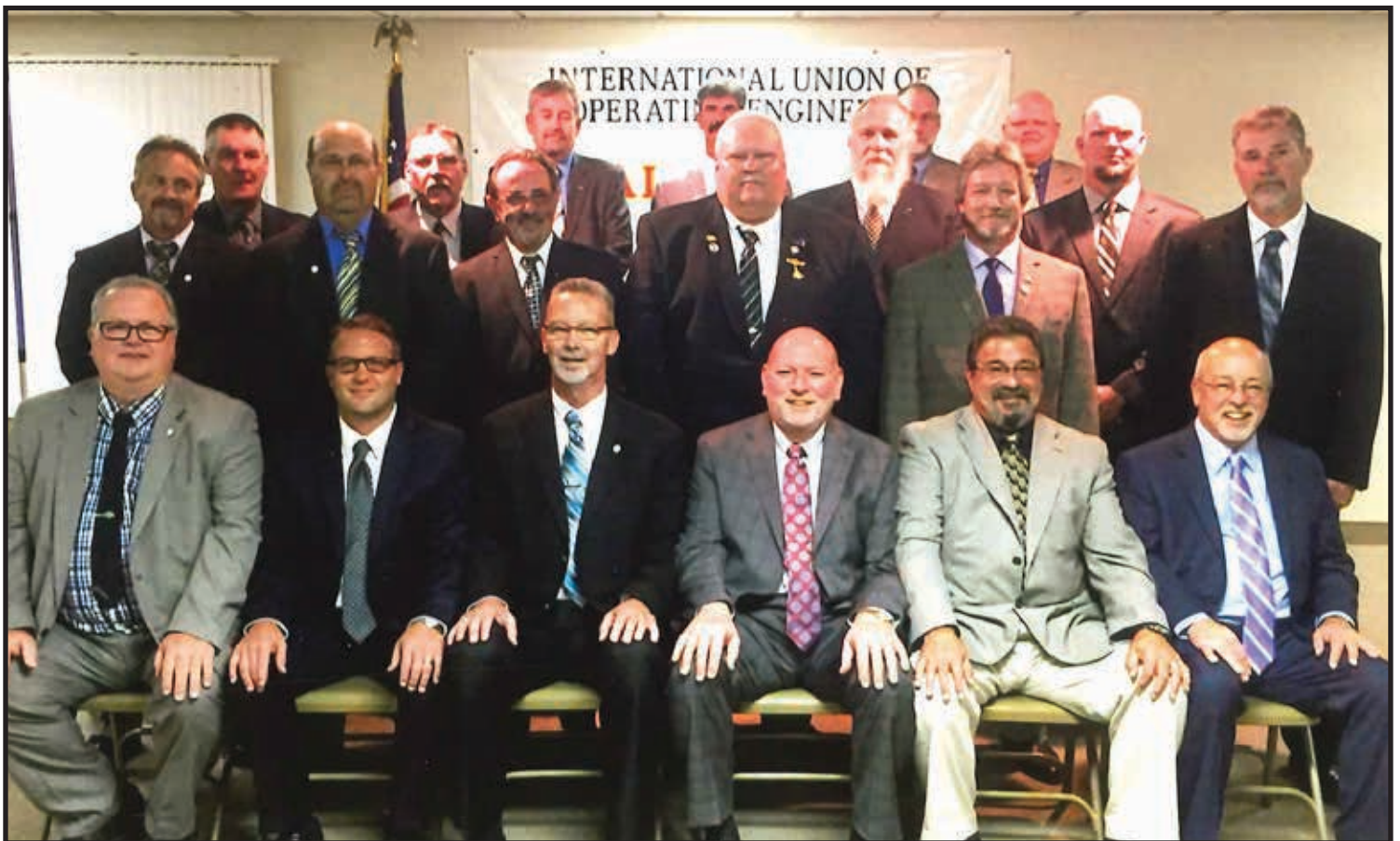
Pictured above are Local 181's Officers installed September 5, 2017 at the Local 181 Headquarters in Henderson, KY.