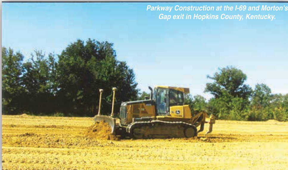
Parkway Construction at the I-69 and Morton's Gap exit in Hopkins County, Kentucky.

If we can be of any assistance, please give us a call at 270-826-2704. ♦