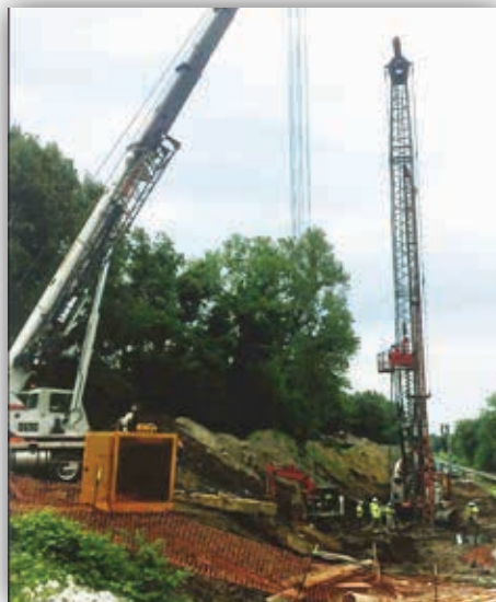
Berkel & Company on the Veteran's Parkway in Evansville, Indiana.

If we can be of assistance, please give us a call at (812) 474-1811. ♦